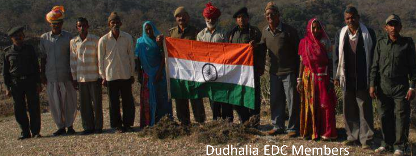
Dudhalia EDC Members