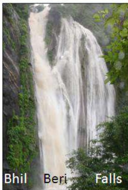
Bhil Beri Falls