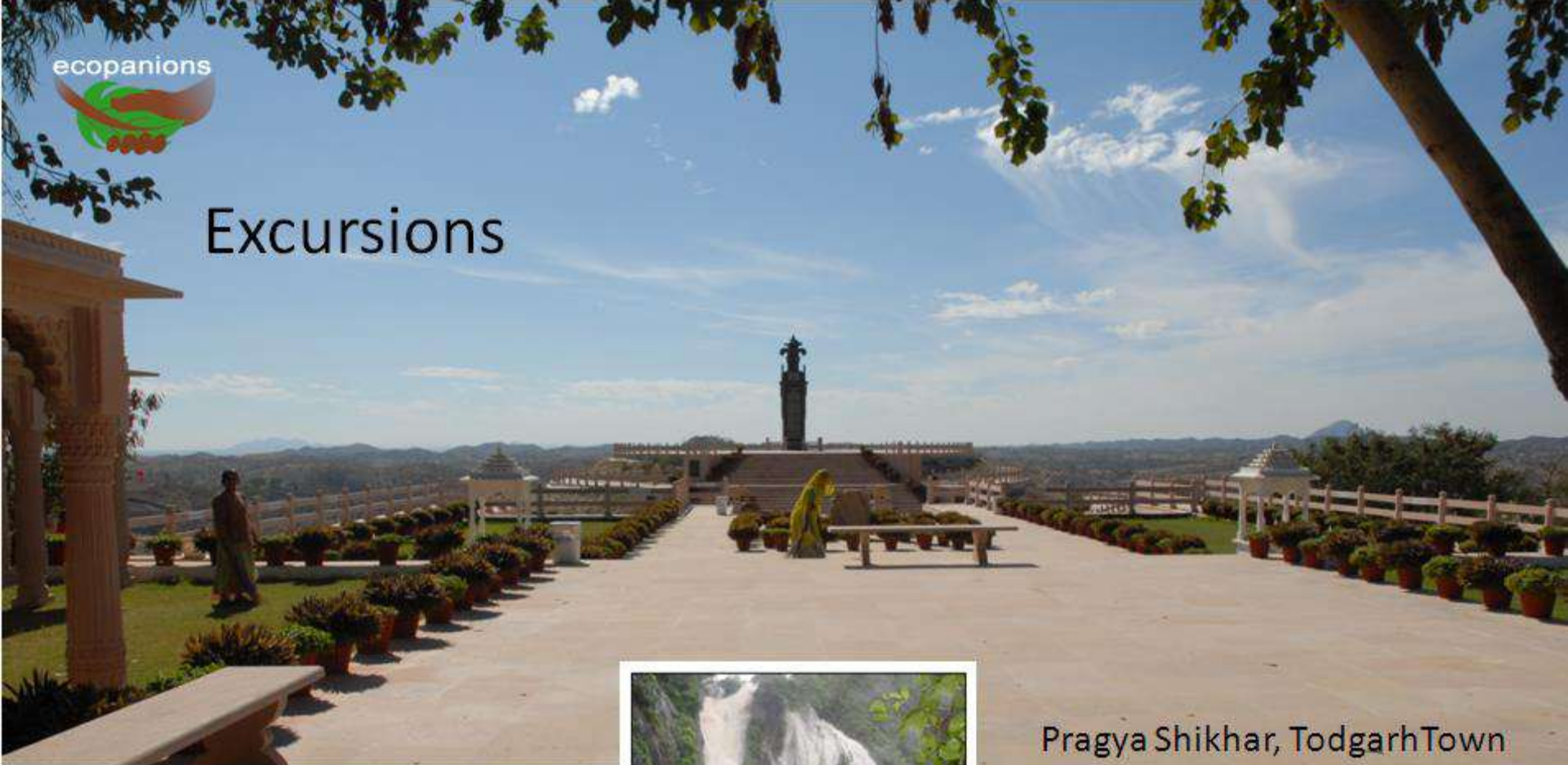
Pragya Shikhar, Todgarh Town