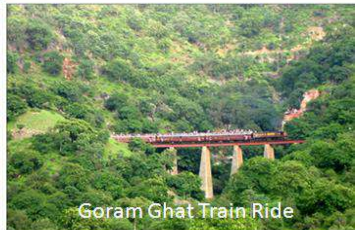
Goram Ghat Train Ride